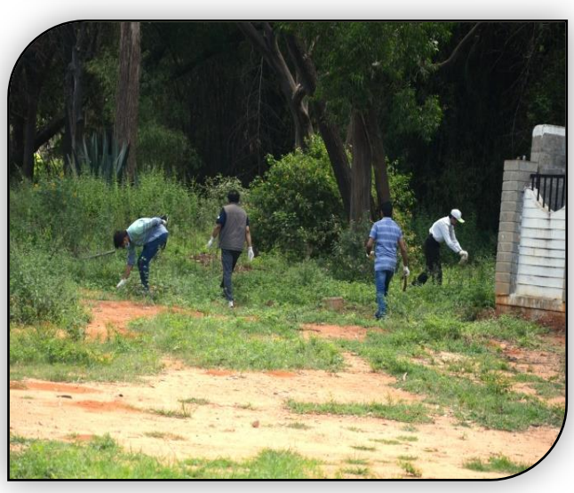
Swachhata campaign in and around Doresanipalya Reserve Forest Campus.