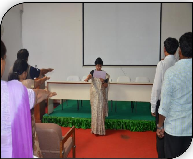
Green pledge taken by the EMPRI staff on Occasion of Swachhata campaign