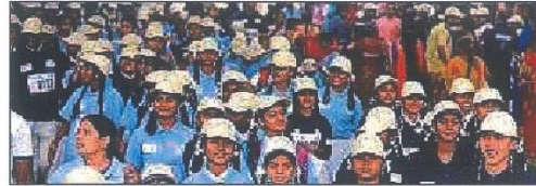
Participants at the 'Beat Plastic Pollution' marathon ahead of the World Environment Day on June 5, at Cubbon Park on Sunday.

Cubbon Park. An exhibition of over 25 stalls was also organised, showcasing the hazards of plastic and the alternatives