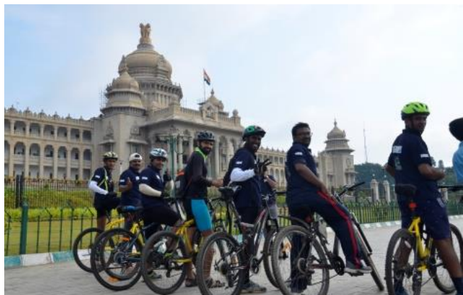
Cyclothon participants in front of Vidhan Soudha, Bengaluru