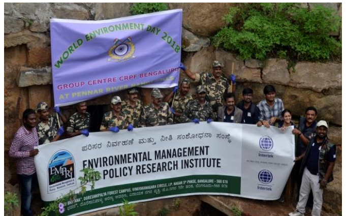
Cleaned the birth place of Pennar/ Palar river in Nandi Hills by CRPF and EMPRI staff