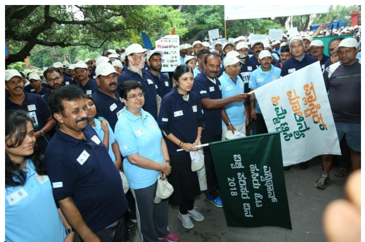
Flag off Envithon by Worshipful Mayor of Bengaluru and Additional Chief Secretary, DoFEE, GoK