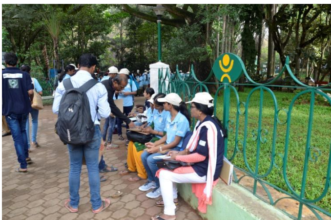
EMPRI staff had issued the Envithon participant certificate to public