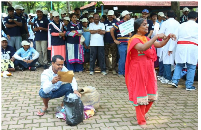
Street play about Beat Plastic Pollution after Envithon-2018