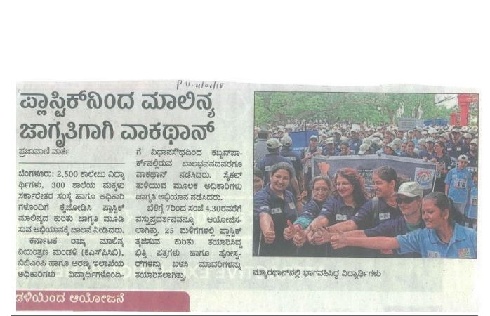
Envithon-2018 published in newspaper on 04/06/2018