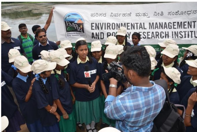
One of the school participants of Kapila Riverfront had briefed about Beat Plastic Pollution to DD TV Channel