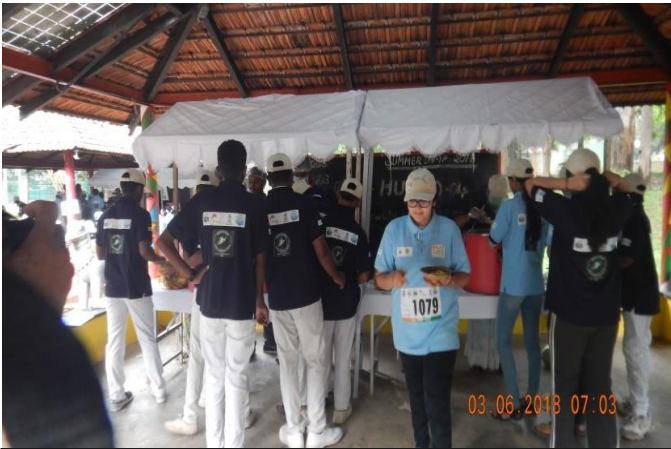
Participants in refreshment stalls of Envithon - 2018