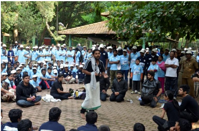
Street play about the alternative to plastics after Envithon-2018 event