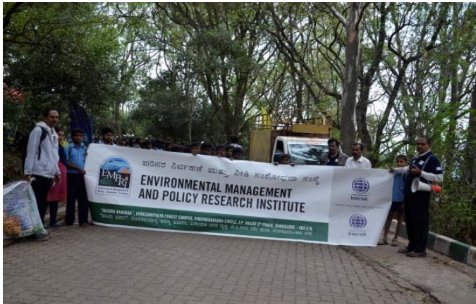
Pennar river front cleaning started in Nandi Hills with 460 participants