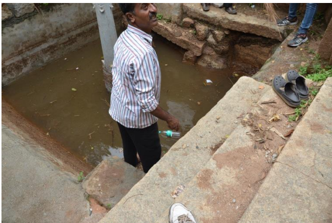
Birth place of Pennar/ Palar river before cleaning