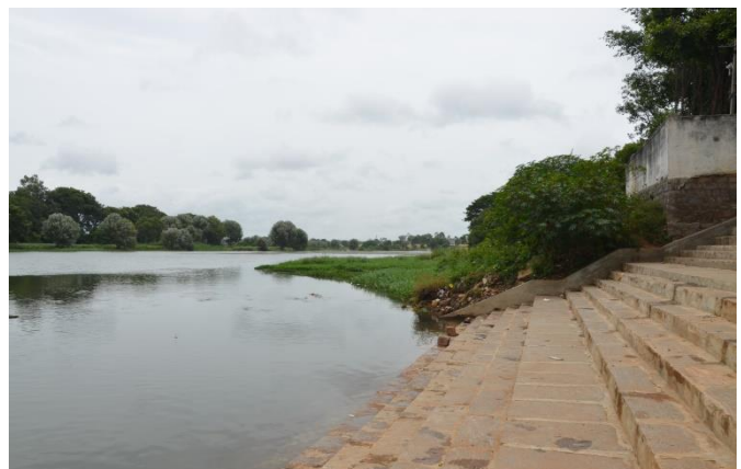
Plastic wastes in Srikanteshwara temple bathing spot of Kapila River front after cleaning