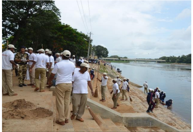
Plastic pollutants removed from Srikanteshwara bathing spot of Kapila River front during cleaning