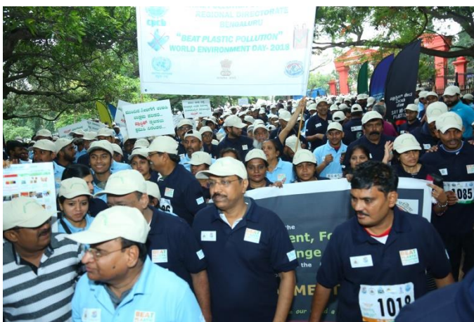
Participants of Envithon - 2018