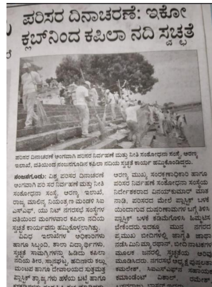
Kapila Riverfront clean news published in the Kannada Prabha newspaper on 13.06.2018