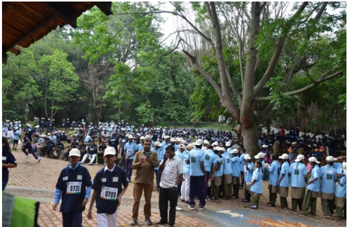
Part of Envithon - 2018 Participants in Bal Bhavan