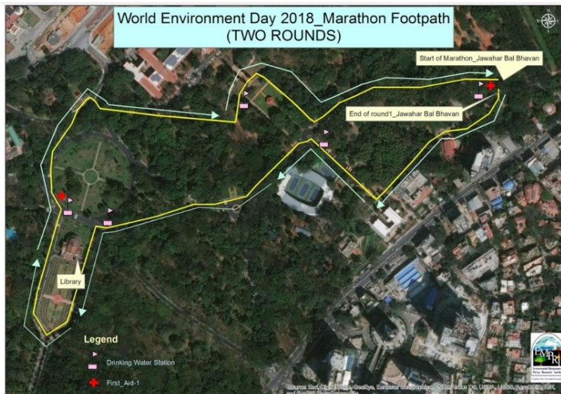
Route map for 5K Envithon – 2018 within Cubbon Park, Bengaluru