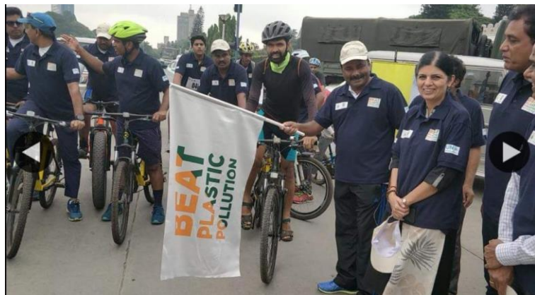
Flag off of Cyclothon by Worshipful Mayor of Bengaluru and Additional Chief Secretary, DoFEE, GoK