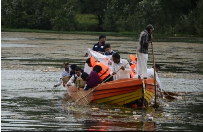
Plastic pollutants collected from Kapila River (Srikanteshwara temple bathing spot)