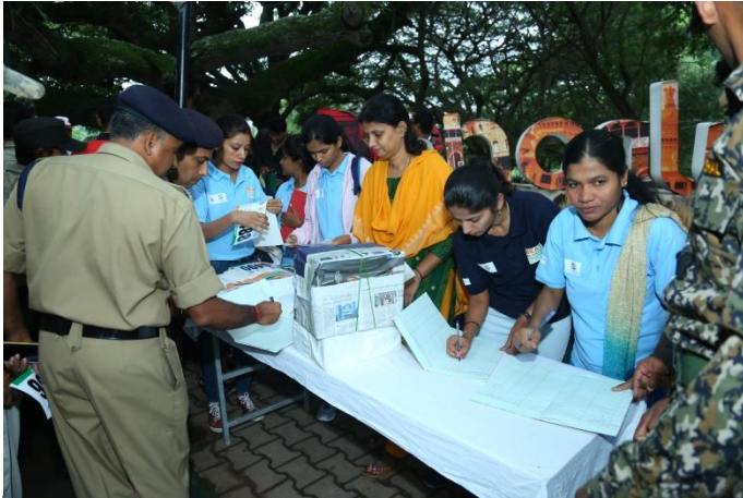
EMPRI Staff in Registration Counter to issue Envithon kit to the participants