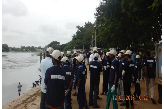
Participants involved in Kapila Riverfront cleaning, Nanjangud