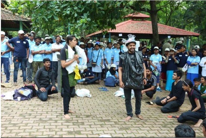
Street play about the impact of plastic pollution on environment after Envithon-2018 event