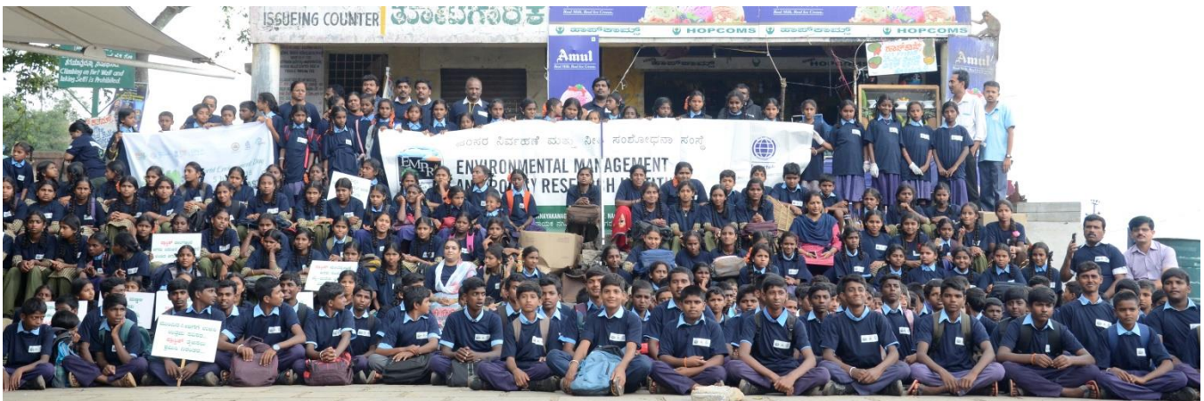
School children participants involved in Pennar river front cleaning in Nandi Hills