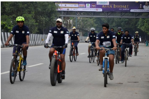
Part of cyclothon participants in Kasturba road, Bengaluru