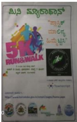
Envithon Advertisement in Vijaya Karnataka Newspapers