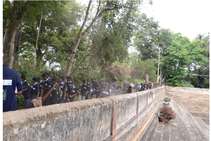
Plastic wastes cleaned by school participants near Amruth Sarovara, Pennar river front (catchment area)