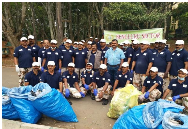
Plastic pollutants collected by IDBP (Bengaluru Sector) during Pennar river front cleaning