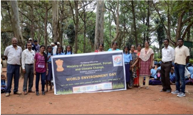
Involvement of MoEF&CC (South Zone - Bengaluru) during Pennar river front cleaning