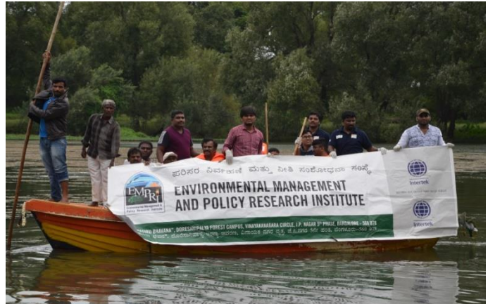
After cleaning of plastic pollutants from Kapila River