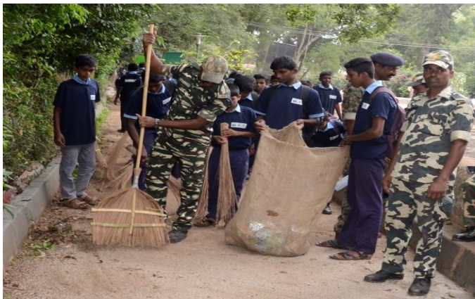
Cleaning of Pennar river front by CRPF with the School Children