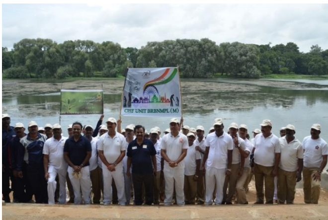
CISF Unit (BRBNMPL & Infosys) participated in Kapila River front cleaning, Nanjangud