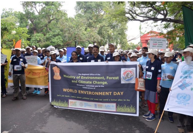
MoEF&CC, South Zone, Bengaluru Participated in Envithon