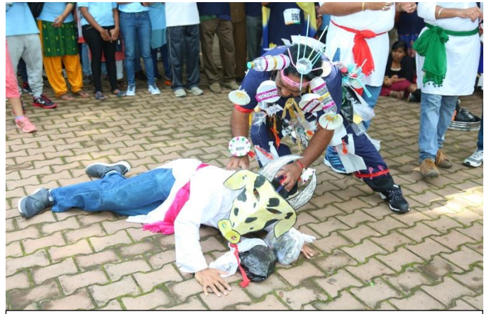
Street play about impact of plastic pollution on domestic animals after Envithon-2018 event