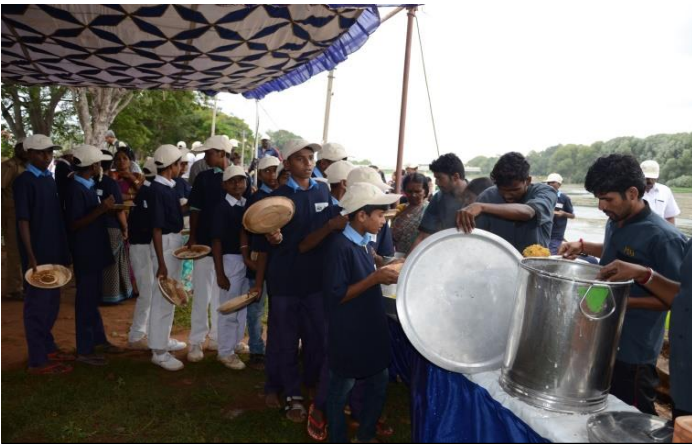
Refreshments provided to the participants, who involved in Kapila Riverfront cleaning, Nanjangud