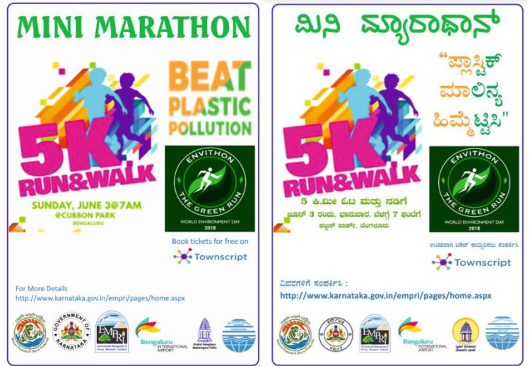
Posters for Envithon in English and Kannada