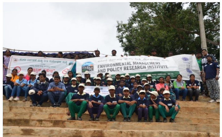
Part of school students participated in Kapila River front cleaning, Nanjangud