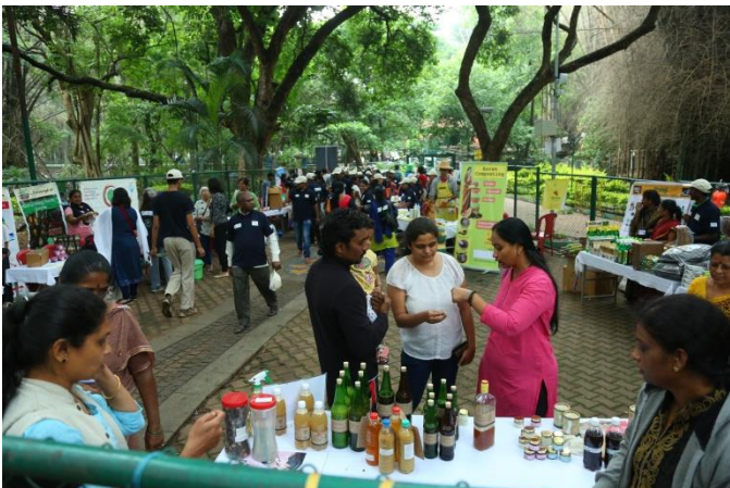
Part of NGO's stalls portraying alternatives to plastics in Envithon