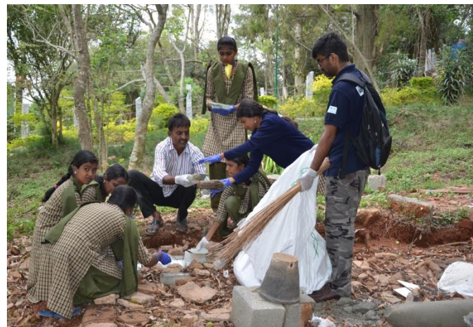
Dumped plastic wastes are cleaned by school students with EMPRI staff in Pennar river catchment area