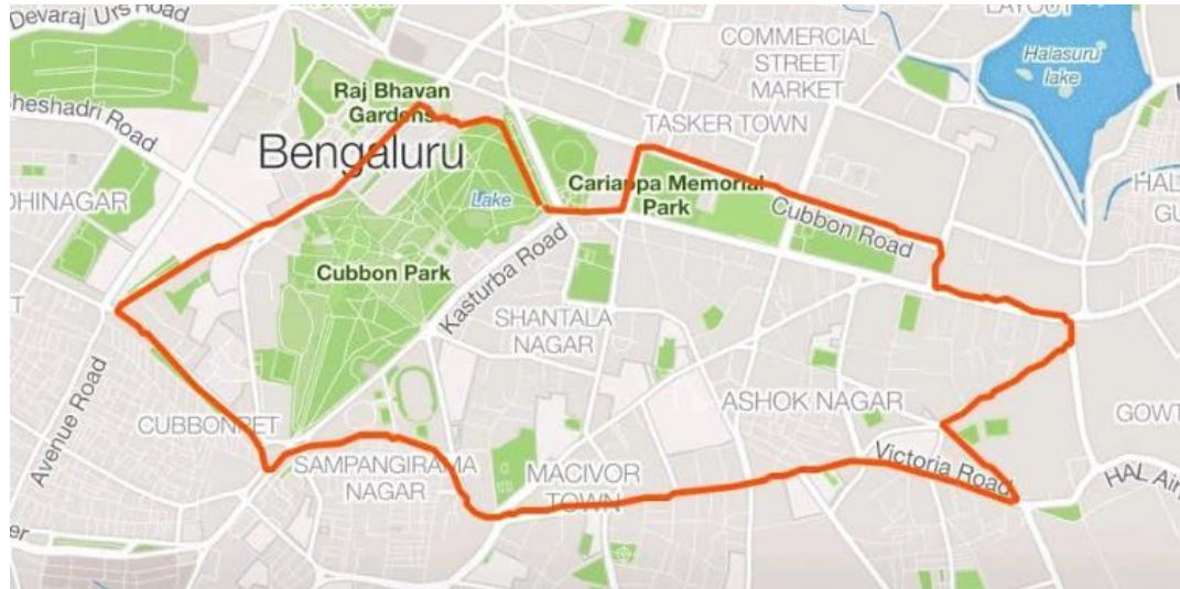
Route map for 10.5Km Cyclothon around Cubbon Park, Bengaluru