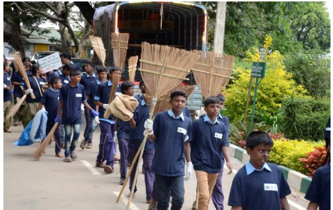
School children in rally for cleaning Pennar river front as awareness creation to tourists in Nandi Hills