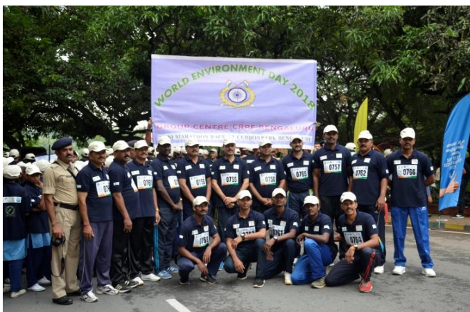
CRPF, Group Centre, Bengaluru Participated in Envithon