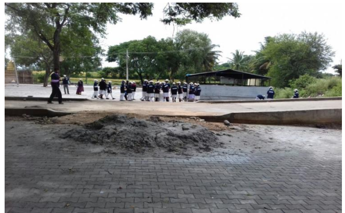
Plastic wastes in Parashurama temple spot of Kapila River front after cleaning