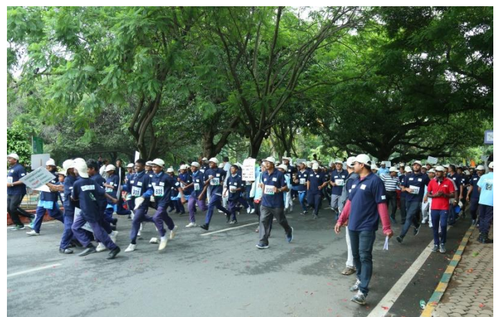
Participants of Envithon - 2018