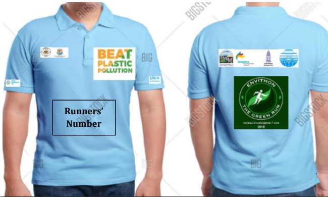
Logos in T-Shirt for Envithon participants (2 Colours)