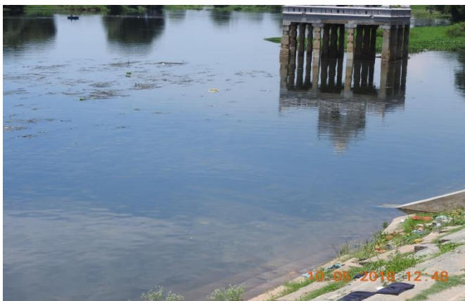
Plastic wastes in Srikanteshwara temple bathing spot of Kapila River front before cleaning