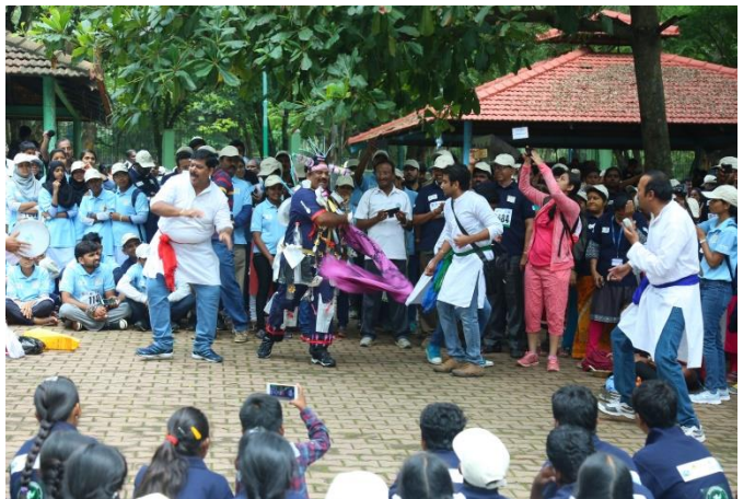
Street play about the plastic pollution after Envithon-2018 event