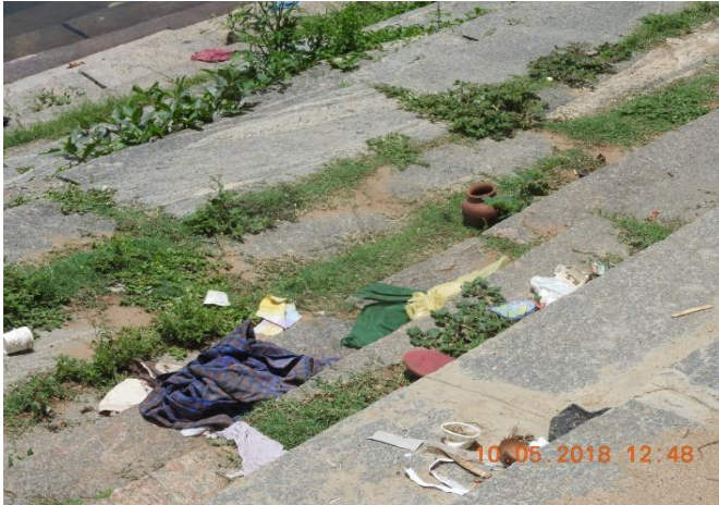
Plastic pollutants in Srikanteshwara temple bathing spot of Kapila River front before cleaning