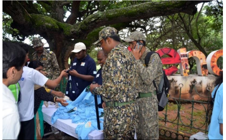
BBMP Marshals helping in issue of Envithon kit to the Participants