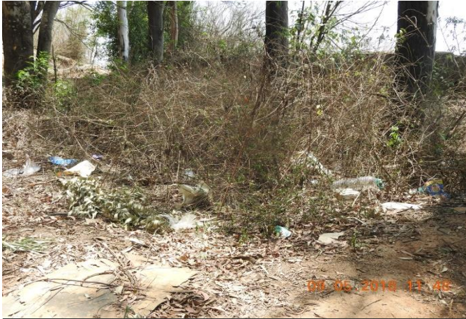
Scattered plastic wastes near Amruth Sarovara, Pennar river front (catchment area) before cleaning