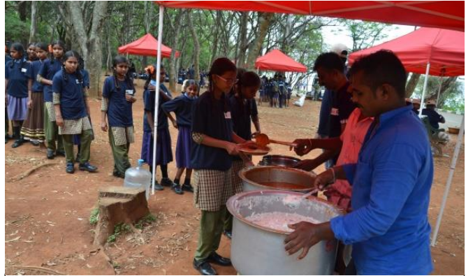
Refreshment provided for the Pennar river front cleaning participants in Nandi Hills