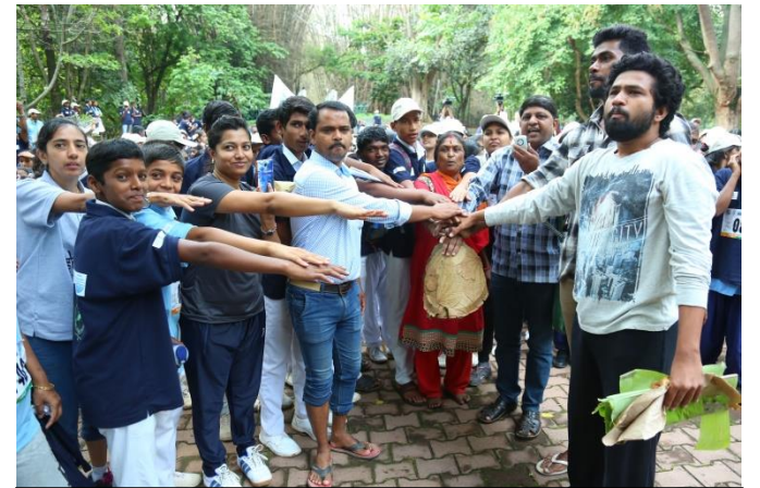
Pledge by Envithon participants that they will "Reuse, Recycle or Refuse the one time use plastics"