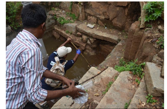
Cleaning the birth place of Pennar/ Palar river