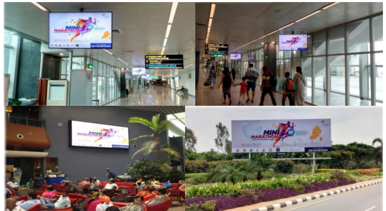
Envithon Advertisement displayed in Bengaluru International Airport