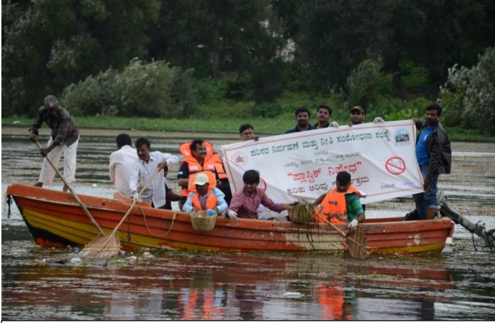
EMPRI staff collected the plastic pollutants from Kapila River, Nanjangud