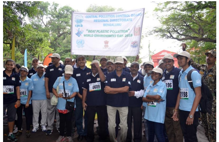
CPCB, South Regional Office Staff, Bengaluru Participated in Envithon