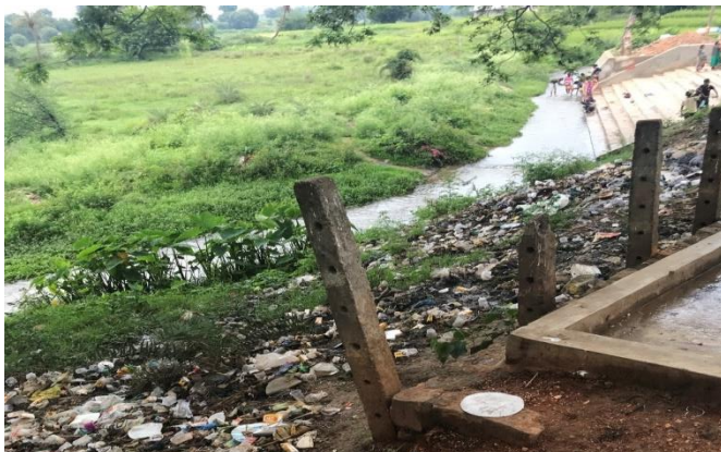
Plastic wastes in Parashurama temple spot of Kapila River front before cleaning