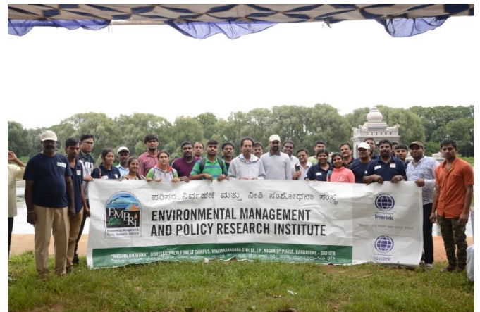
EMPRI staff participated in Kapila River front cleaning, Nanjangud