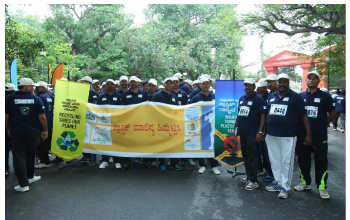
Part of Envithon-2018 Participants