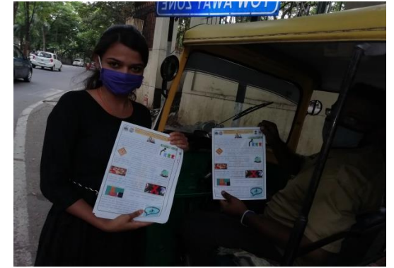
Distributing flyers to the auto drivers at Bangalore