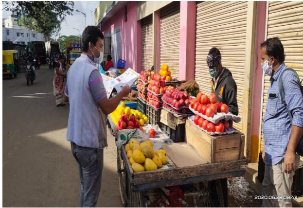
Awareness on Solid waste management rules 2016