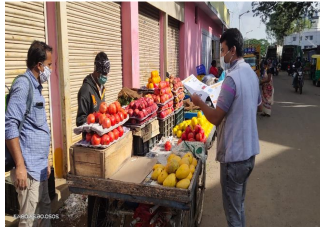
Distributing the flyers to Public