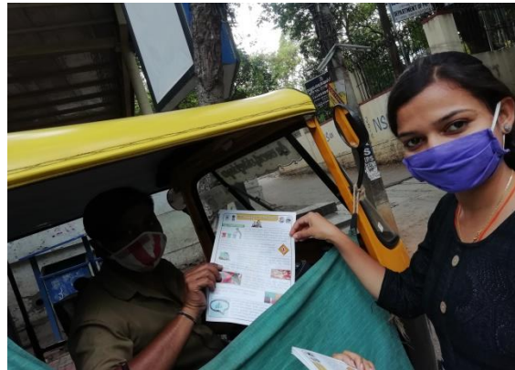
Distributing flyers at bus stops of Bangalore