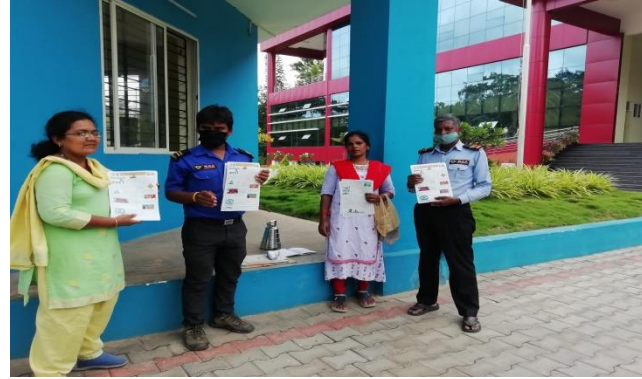
Flyers are distributed to staff of “Suvarna bhavana Bangalore water supply and sewerage board malleshwaram Bangalore.