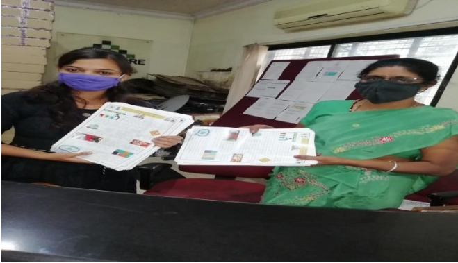
Distributing flyers at “Bangalore one office” Malleswaram