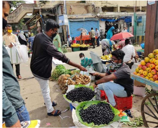
Campaign at K R Market