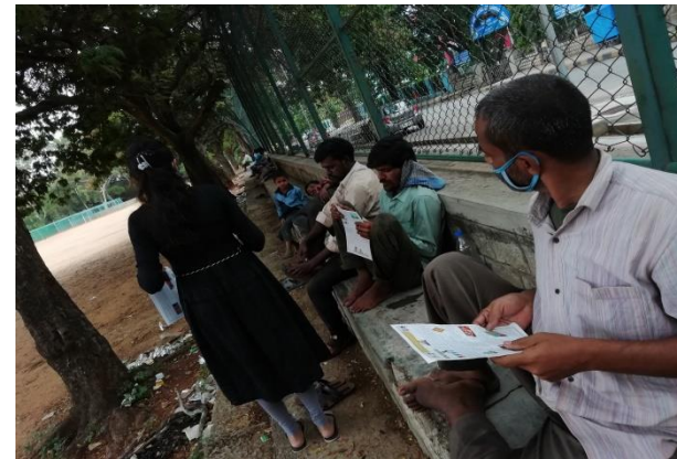
Distributing flyers to the public at parks and playgrounds