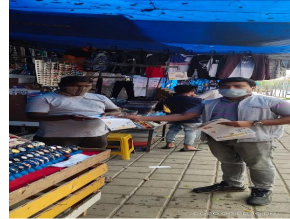
Distributing flyers to street vendors