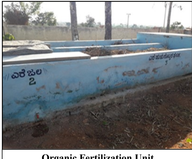
Organic Fertilization Unit