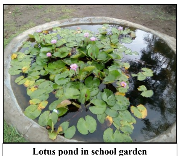
Shri N G B Government High School Shirur garden.