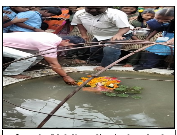
Ganesha Idol discarding in the school pond