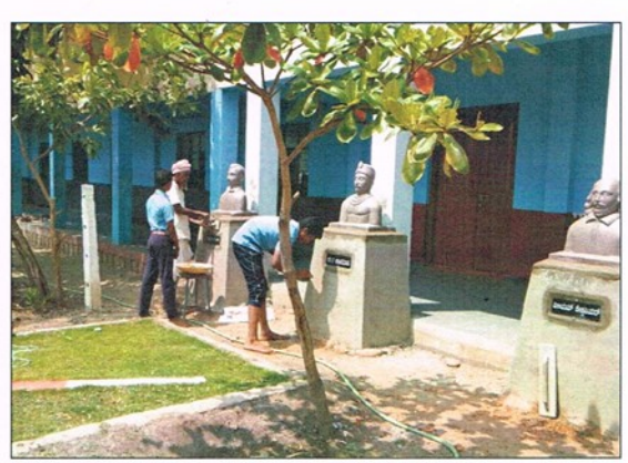
ಶಾಲಾ ಆವರಣದಲ್ಲ ಶಿಲಾ ಉದ್ಯಾನವನ