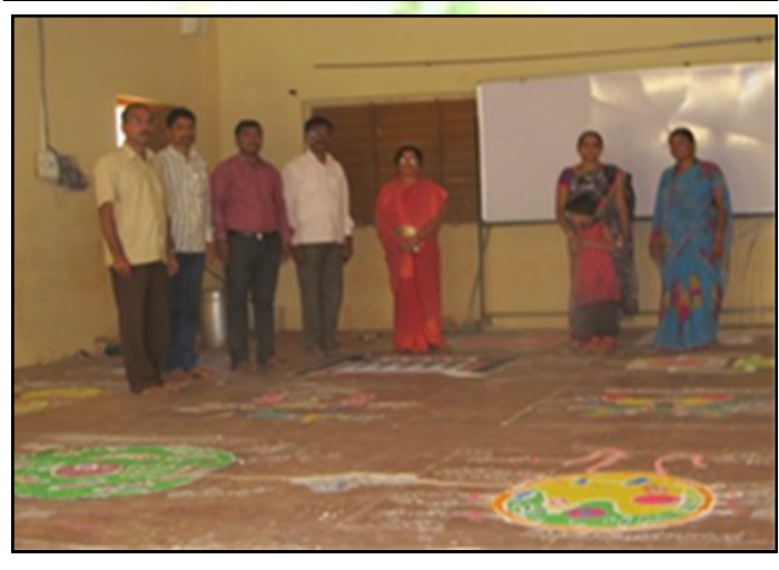
Science Diagrams Competition in Rangoli Powder