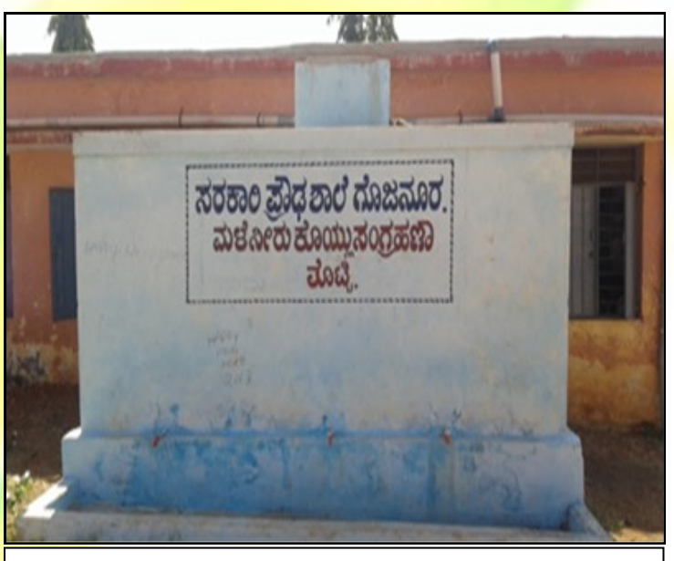
Rain water Harvesting Unit