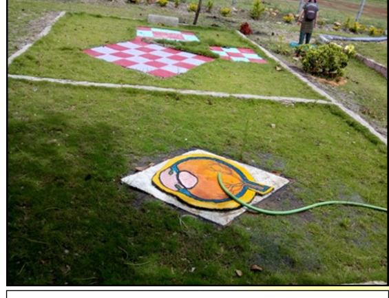
Science models in the school garden