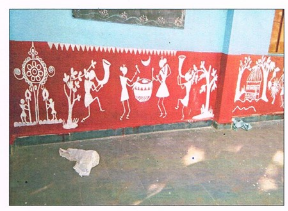
ಪರಿಸರ ಅವರಣದಕ್ಕಿ ಮಕ್ಕಳಂದ ರಚಿತವಾದ ವರ್ಲ ಪೇಂಟಂಗ್ಸ್ Warli Painting by Our School Students.