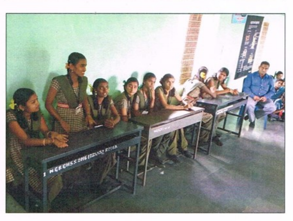
ಇಕೋಕ್ಲಬ್ ವತಿಯಿಂದ ಕ್ಷೀಜ್ ಮತ್ತು ಸಂಪನ್ಮೂಲ ವ್ಯಕ್ತಿಗಆಂದ ವಿದ್ಯಾರ್ಥಿಗಆಗೆ ಬೋಧನೆ

QUIZ COMPITION CONDUCTED IN ECO CLUB AND LECTURE BY RESOURCE PERSON.