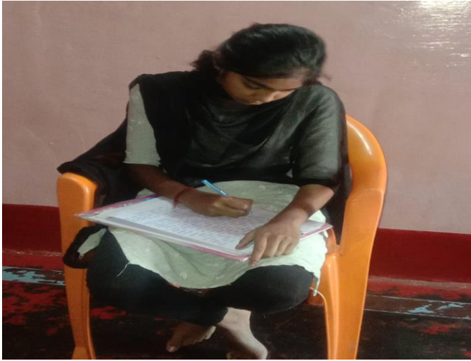
Essay Writing for Eco-club students on Human Rights