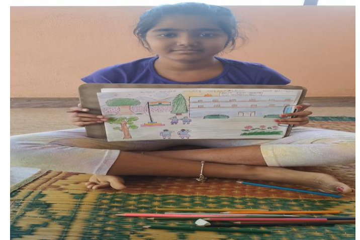
Drawing competition for Eco-club students