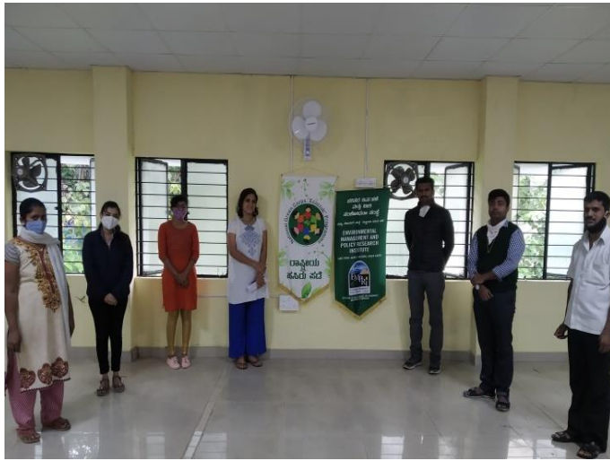
Constitution day preamble oath by EMPRI staff