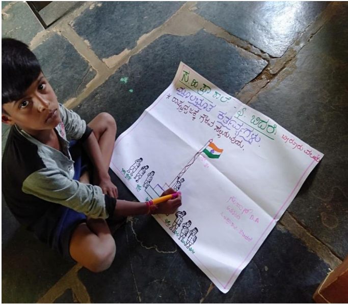
Drawing competition for Eco-club students on Fundamental right