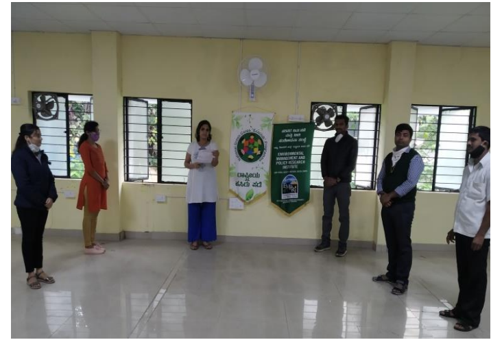
Constitution day preamble oath by EMPRI staff