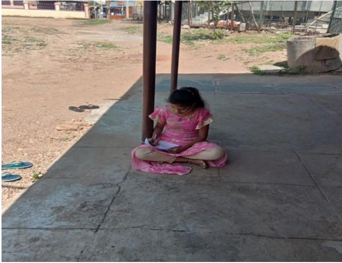
Essay Writing for Eco-club students on Human Rights